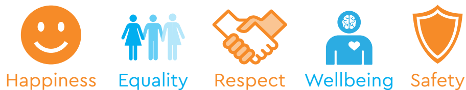
FIGURE 1: Online rights in higher education

The remaining rights in this charter have been categorised into five values, as demonstrated in FIGURE 1 below: